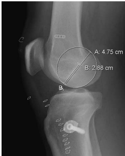
Figure 1. Lateral radiograph demonstrating the assessment of femoral tunnel position as described by Amis et al 3 and validated by Klos et al. 26 In this example, the femoral tunnel position is 2.88/4.75 \times 100\% = 60.6\% . Also, there is no intercondylar roof impingement in this case as demonstrated by the position of the anterior edge of the tibial tunnel posterior to Blumensaat's line.

of graft roof impingement was determined from the lateral radiograph with the knee positioned in hyperextension. Radiographic roof impingement was present if, on the lateral radiograph, the anterior edge of the tibial tunnel was anterior to Blumensaat's line. Containment of the tibial tunnel within the confines of the tibial eminences was also checked on the AP radiograph. The coronal tibial tunnel angle was obtained by measuring on the AP radiograph the acute angle between a line drawn along the axis of the tibial tunnel and a line drawn parallel to the tibial plateau (Figure 2).