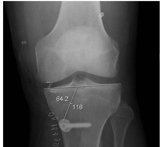
Figure 2. Anteroposterior radiograph demonstrating the assessment of coronal tibial tunnel angle and containment of the tibial tunnel within the tibial eminences as described by Howell et al. 19 In this example, the coronal tibial tunnel angle is 64.2^\circ and the tibial tunnel is contained between the tibial eminences.

The objective portion of the 2000 IKDC evaluation system 21 was completed by orthopaedic surgeons throughout the military who were blinded to treatment (during follow-up evaluations, the patients' knees were covered with stockinnettes, preventing the evaluator from determining the